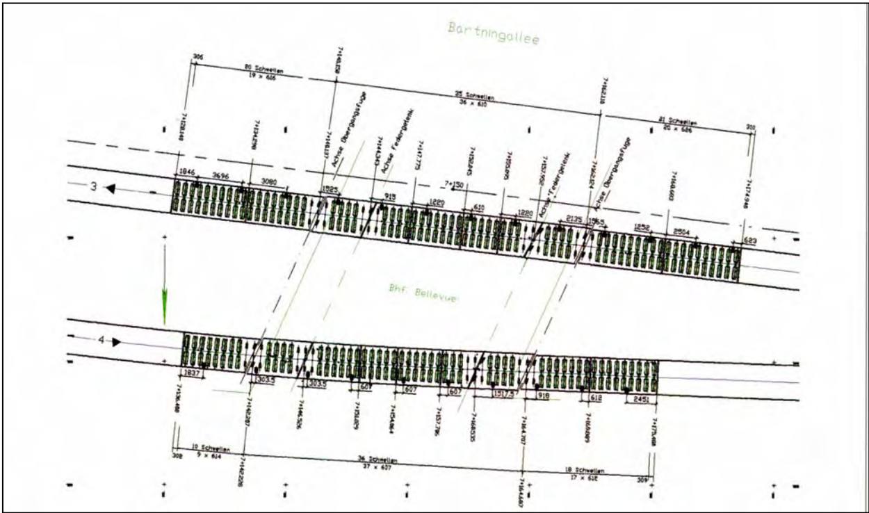
Distribution of sleepers individual base plates in ogulated transition to bridges

④ Project of fastening of conductor rail support: