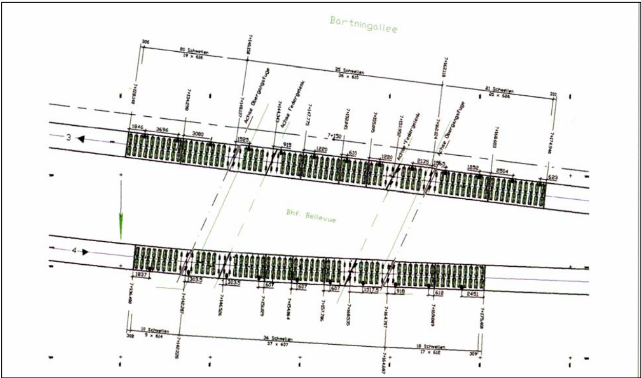
Distribution of sleepers individual base plates in ogulated transition to bridges

④ Project of fastening of conductor rail support: